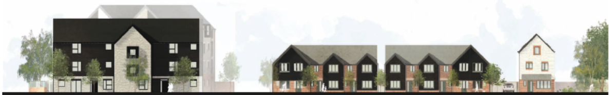
Bin Lane/ B-B Elevation