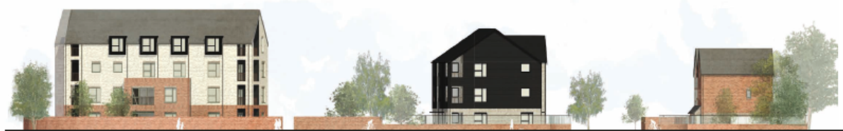
New Wokham Lane/ D-D Elevation