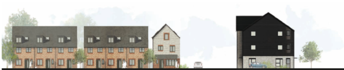
C-C Street Elevation