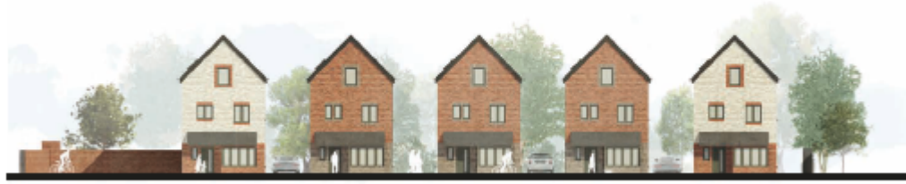
A-A Street Elevation